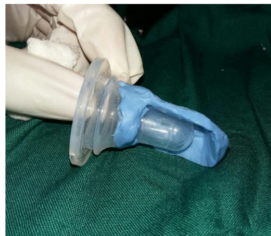
Figure 4. Putty was shaped according to the cast and attached to the nipple.

The resulting cast that made using the blue dental plaster interpreted patient's palate model with cleft. Subsequently, feeding obturator was fabricated using putty impression material or additional silicone, and standard feeding bottle was prepared. The feeding bottle could be found at baby shop. The putty impression material material was prepared to enable to be shaped. Next, the putty impression material was shaped according to the model of cleft that had been molded with blue dental plaster. The nipple of feeding bottle was positioned at occlusal area. Additional silicone was also shaped to fixate the nipple (Figure 4).