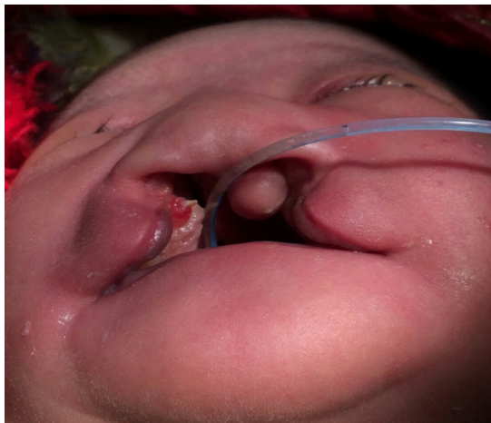
Figure 1. Clinical condition of patient with CLP on nasogastric tube.

A 10-day-old female infant came to oral and maxillofacial clinic at Hospital of the University of Brawijaya with complaint of not being able to breastfeed or feed from a normal bottle and accordingly need to use spoon for milk feeding. Patient was planned to perform first operation at 3 months of age. According to clinical examination, patient was presented with cleft lip and cleft palate. During at-home care, nasogastric tube (NGT) had been placed on the patient to facilitate milk intake into the stomach (Figure 1).