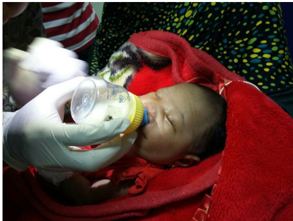
Figure 5. The application of feeding bottle modified with obturator.

excessive putty material, which, if present, was trimmed to obtain the suitable shape. Once the fit was confirmed, it was then assembled back to the body of the bottle and could be used to feed the baby for later (Figure 5).