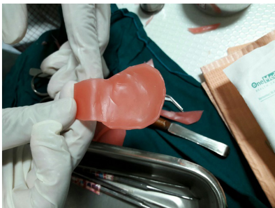
Figure 2. The making of palatal impression using red wax material.

At the first visit, impression procedure was performed using red wax material (Figure 2). That material was warmed to obtain more flexible consistency, then it was inserted into oral cavity of the infant and shaped manually by operator's hands according to the defect on infant's palate. Impression making using the red wax material can be repeated 2-3 times to obtain the most accurate cast.